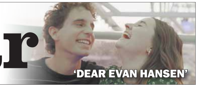
'DEAR EVAN HANSEN'